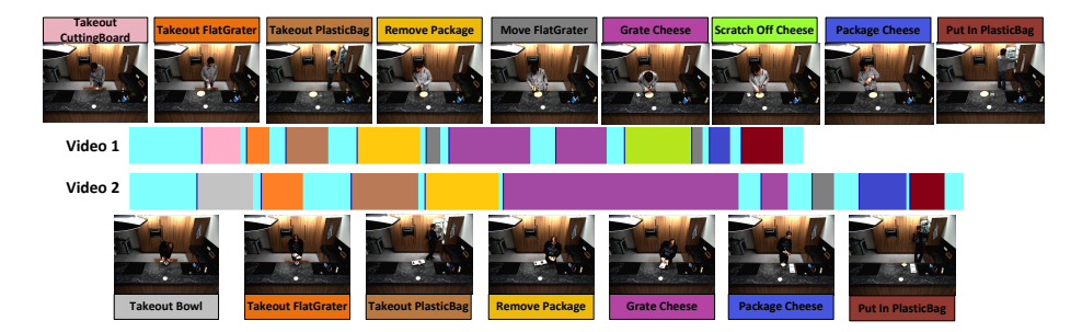
Fig. 1: Composite event Grating Cheese is composed of numerous primitive actions which occur with varying durations and arbitrary gaps between them, making it a challenge to learn a composite event classifier.